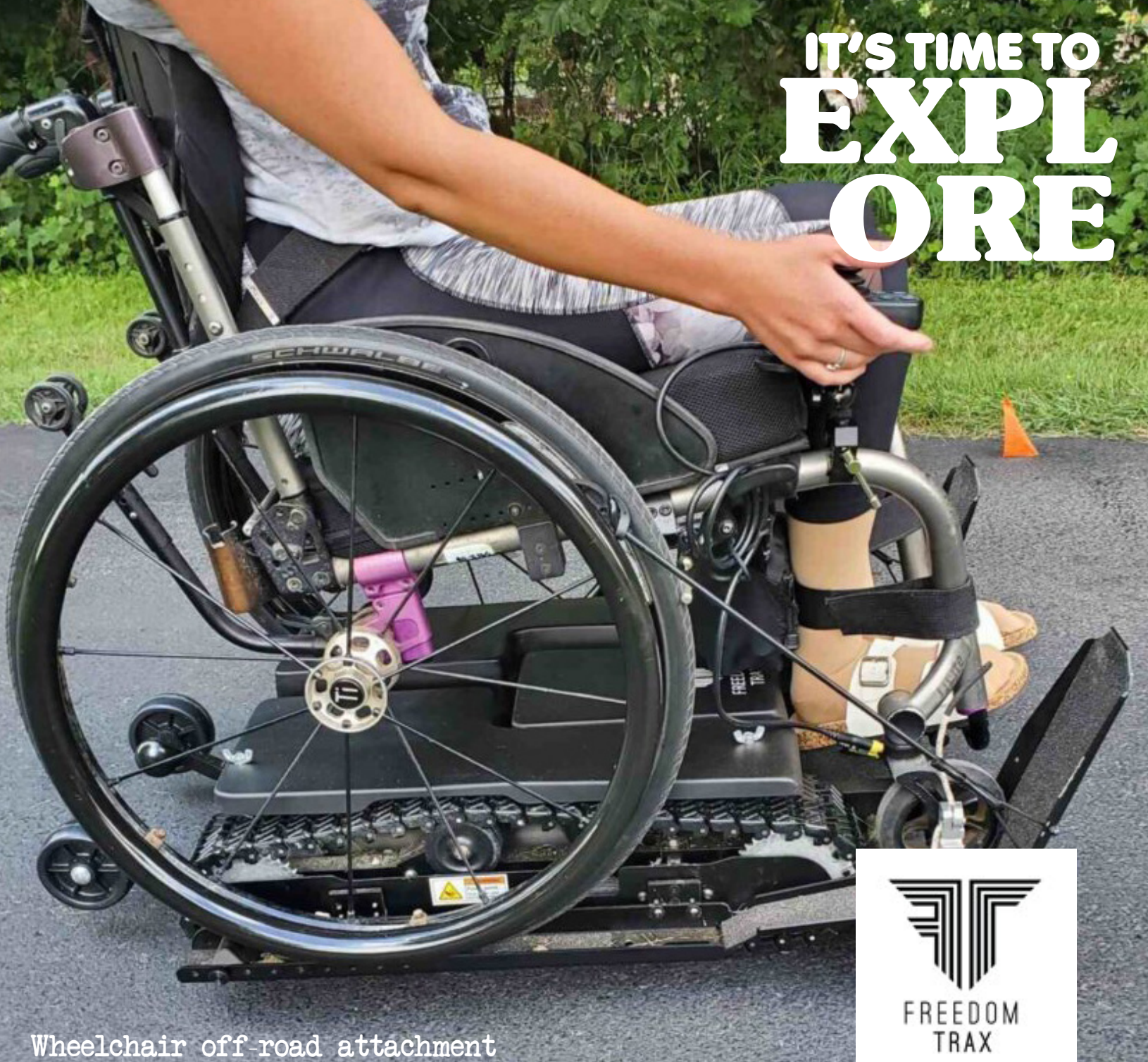
Wheelchair off-road attachment